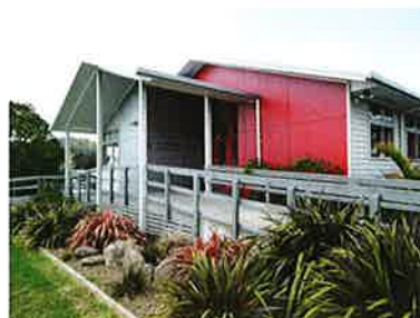
He Matariki Teen Parent School governed by Mangakahia Area School